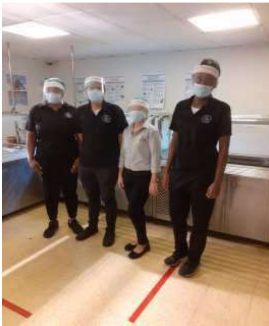
Proper PPE for service...