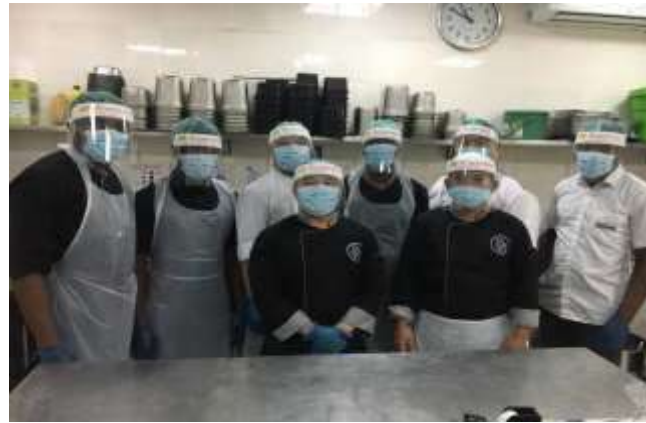
... and kitchen